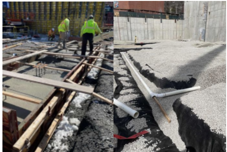
Welding Clips at Core C - in preparation for Steel erection start on 4/4/22. (Photo Below)

Completed core C, interior footings and high foundation walls Building C. Interior Footings (photo on left) at C completed, underdrainage piping complete (photo on right). Waterproofing continues as walls are completed.